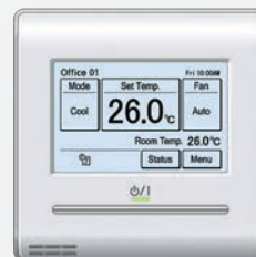
Wired Touch Controller UTY-RNRYZ3