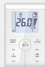
Simple Wired Controller* UTY-RSRY

*Optional Communication Kit required for connection